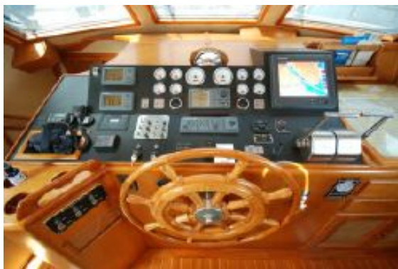
> Pilot House- Helm 2