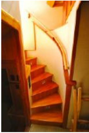
> Stairway to staterooms