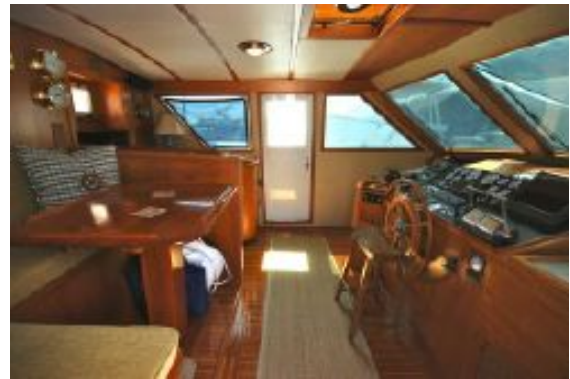
> Pilot House 2