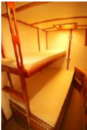
> Guest Stateroom