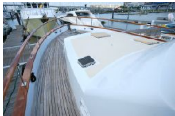
> Fordeck 3