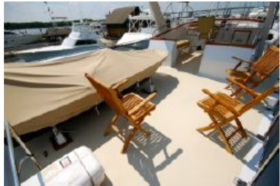
> Aft Bridge Deck