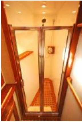
> Guest Head- Shower