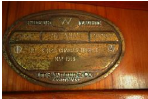
> GITANA Plaque