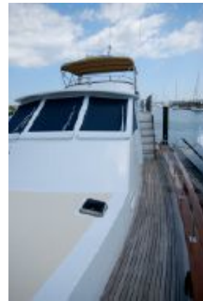
> Side Walkway Port