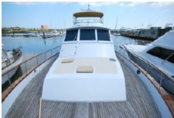
> Fordeck 2