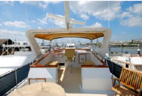
> Flybridge 2