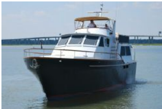
> 3/4 Profile