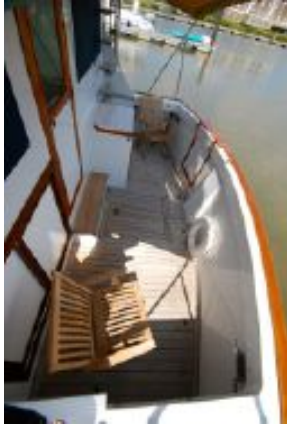
> Aft Cockpit