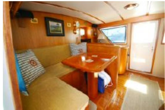
> Pilot House - Dinette