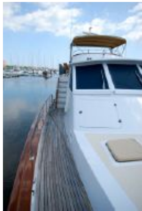
> Side Walkway Starboard