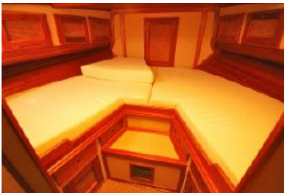
> VIP Stateroom