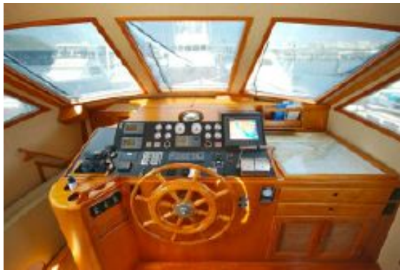
> Pilot House- Helm