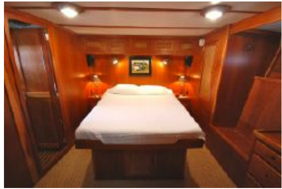
> Master Stateroom