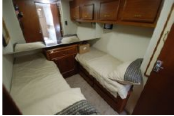
> Guest Stateroom