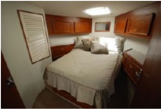
> Master Stateroom