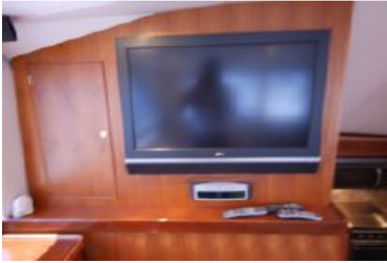
> New Flat Screen