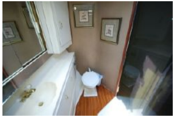
> Guest Head