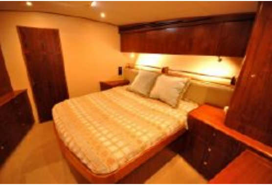
> Master Stateroom