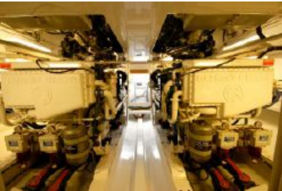
> Engine Room 2