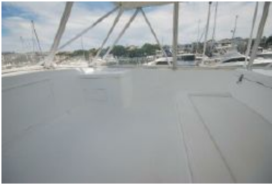
> Flybridge 4