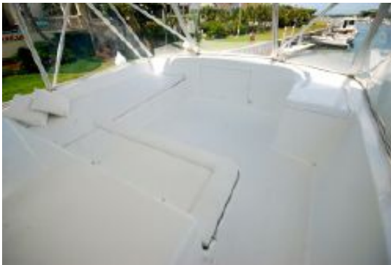
> Flybridge seating