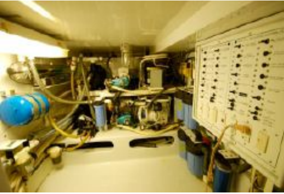
> Pump Room Starboard