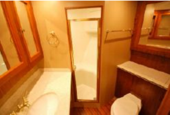
> Master Head