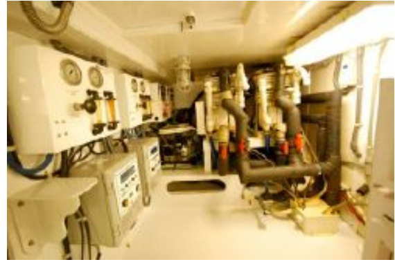
> Pump Room Port