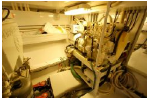
> Port Generator