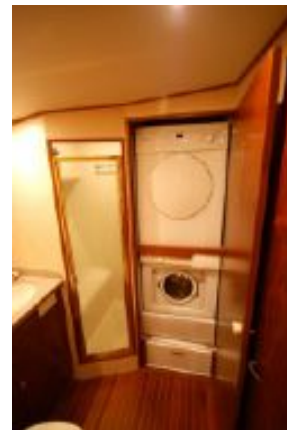
> Guest Head- Washer Dryer