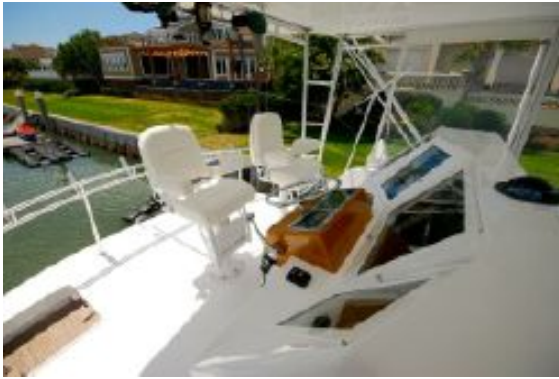
> Flybridge 2