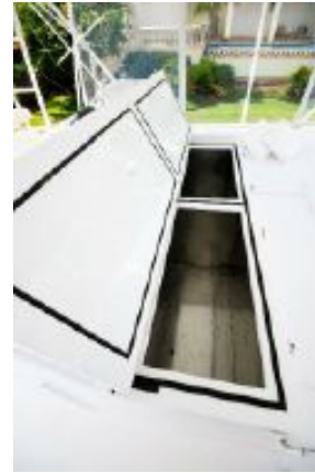
> Flybridge Freezer