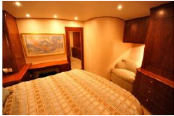
> Master Stateroom 2