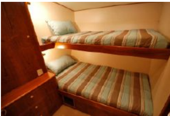
> Guest Stateroom Port