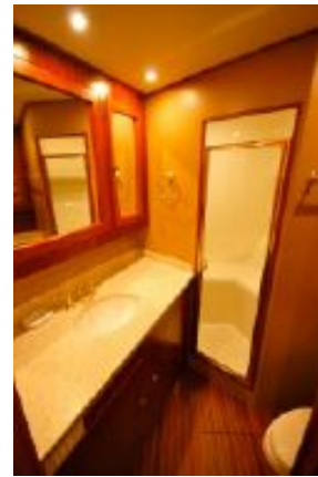
> Guest Head