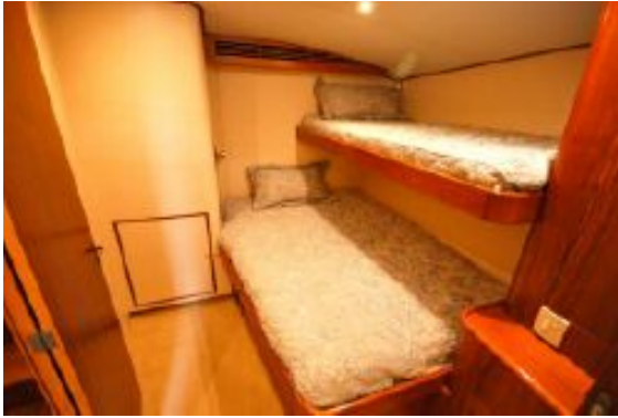
> Guest Stateroom