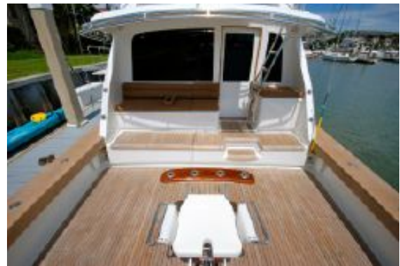
> Cockpit 2