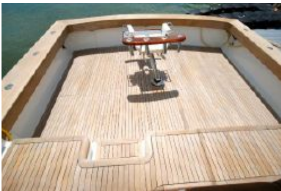
> Cockpit 3