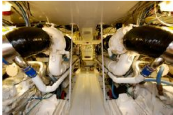
> Engine Room