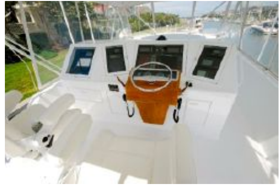
> Flybridge 3