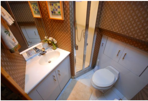
VIP Head - Forward