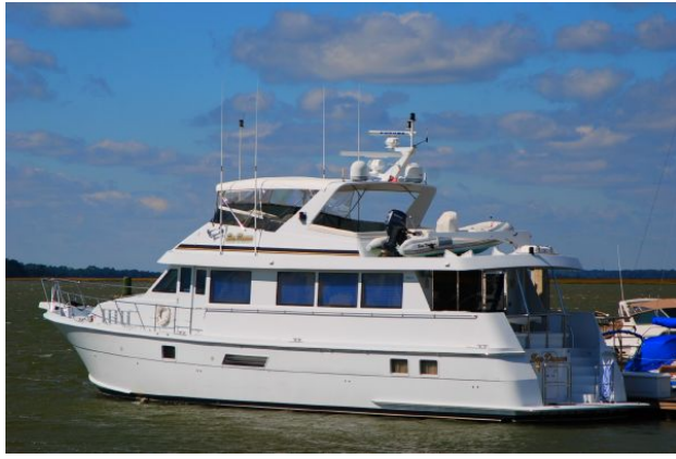
Profile - Port