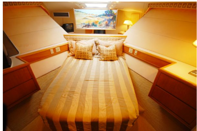
VIP Stateroom - Forward