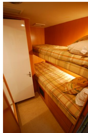
Guest Stateroom - Aft