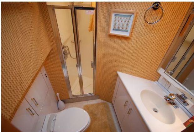
VIP Head - Amidship, Port