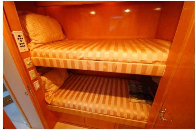
Guest Stateroom - Forward