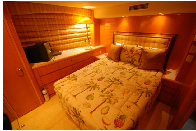
VIP Stateroom - Amidship, Port