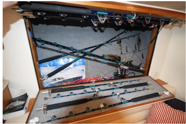
Custom Rod Storage