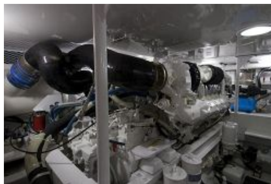
> Engine room- Starboard