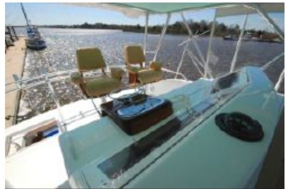
> Flybridge Helm