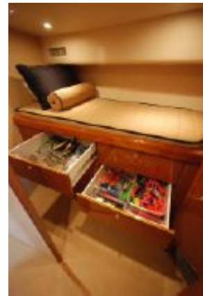
> Custom Starboard Stateroom/tackle locker