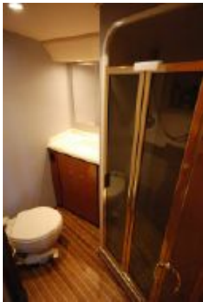
> Forward Head