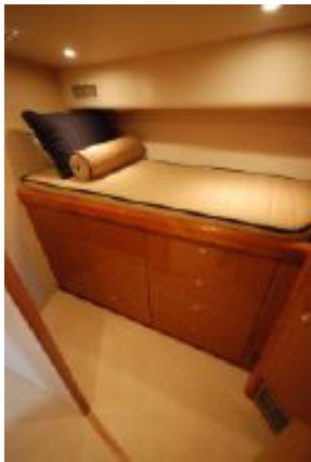
> Custom Starboard Stateroom