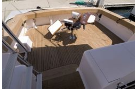
> Release Marine Fighting Chair