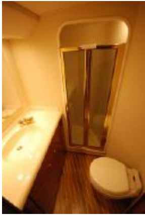
> Master Head