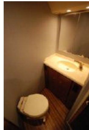
> Forward Head