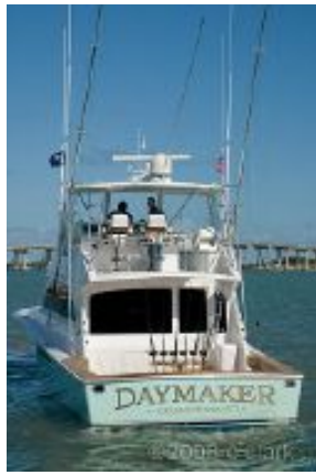
> Stern view