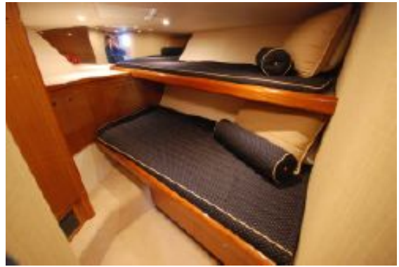
> VIP Stateroom Forward