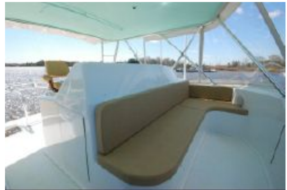
> Flybridge Seating