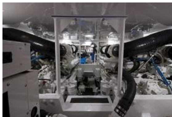
> Engine room