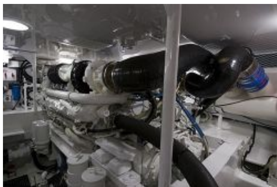
> Engine room- port