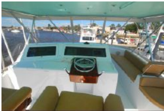
> Flybridge Helm