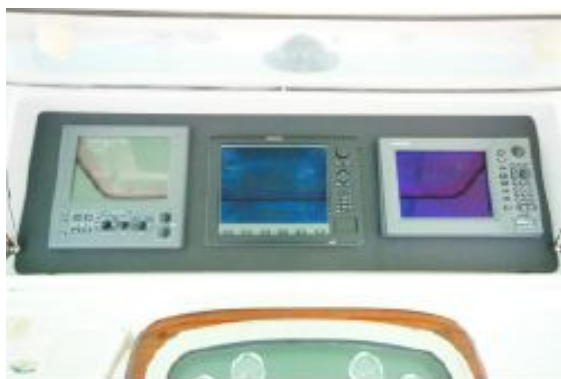
> Helm Electronics