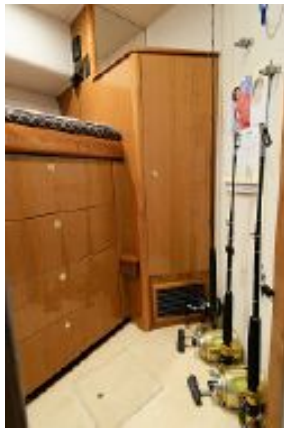
> Custom Starboard Stateroom/tackle locker