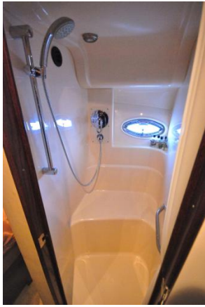
Shower to Starboard