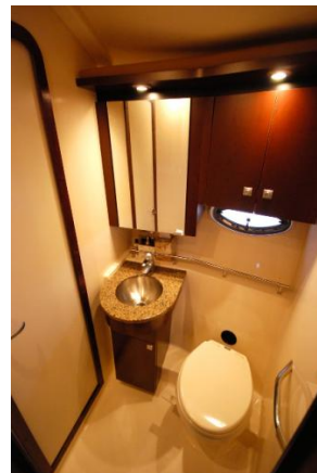
Head to Port