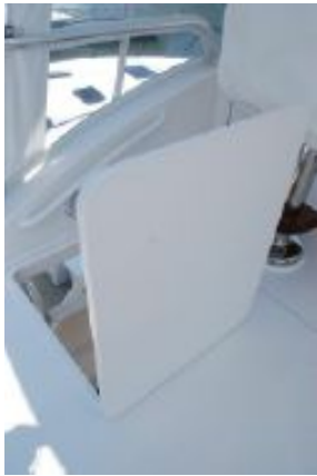
> Bridge Hatch