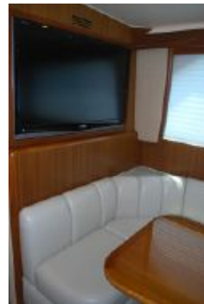
> 42" LCD TV