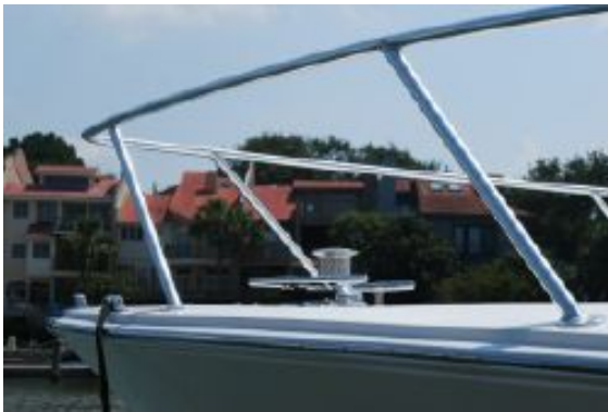
> Bow / Windlass