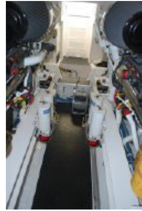
> Engine Room