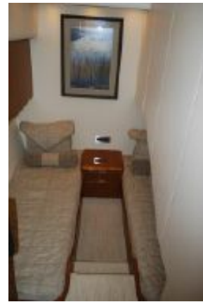
> Guest Stateroom