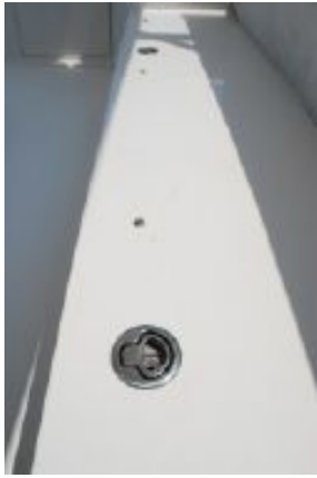
> Lockable Bridge Rod Storage