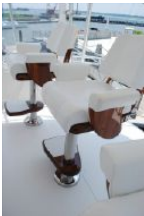
> Release Helm Chairs