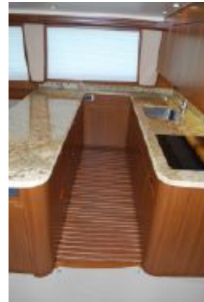
> Galley Sole