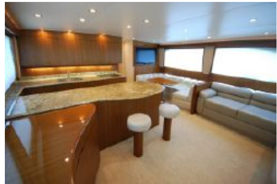
> Salon III