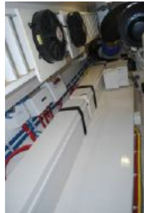
> Outboard Side Stbd.