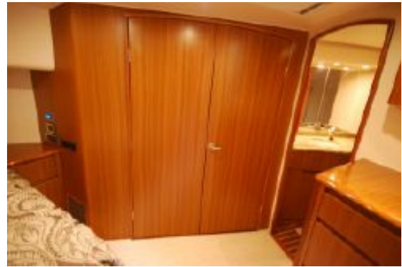
> Master Closet