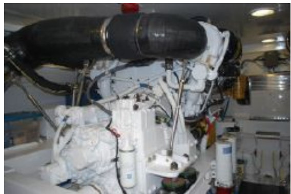
> Engine Room