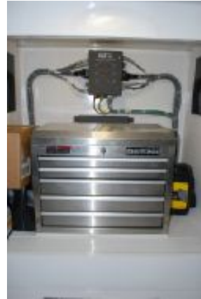
> Tool Box