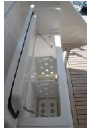
> Mezzanine Seat - Refrigerated