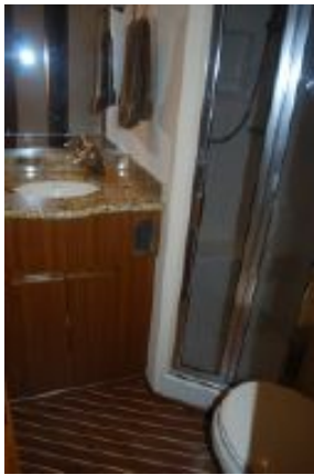
> VIP Head