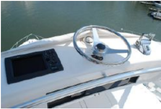
> Tower Pod