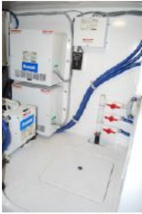
> Air Conditioning Pump Room Stbd.