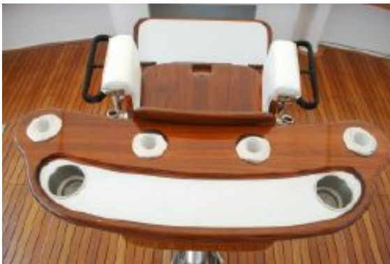
> Release Chair