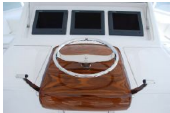
> Helm Pod