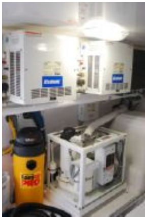
> Engine Room Aft