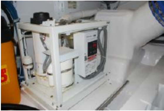
> Eskimo Ice Chipper