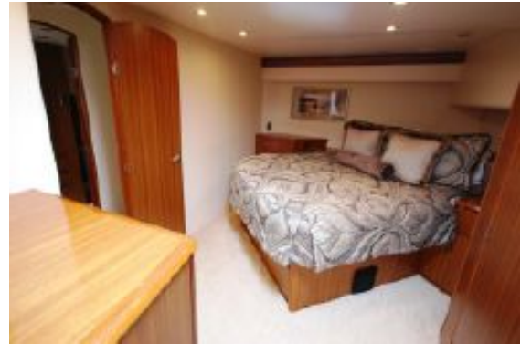
> Master II