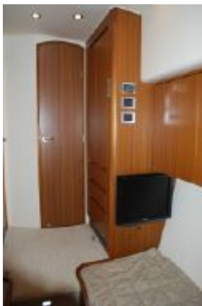
> Guest Stateroom