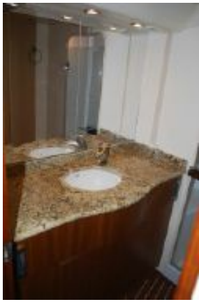
> Master Head