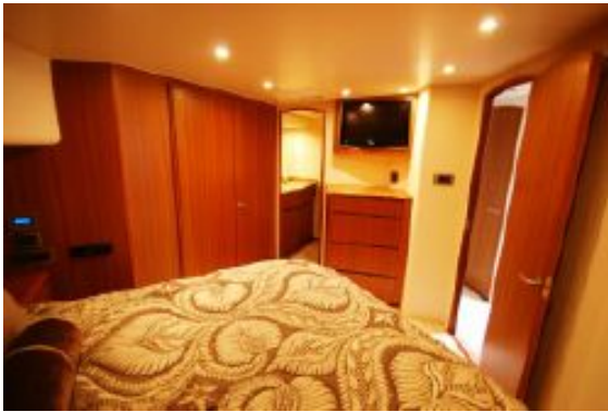
> Master III