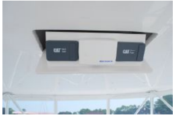
> Drop Down Box