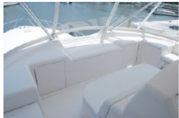
> Bridge Seating