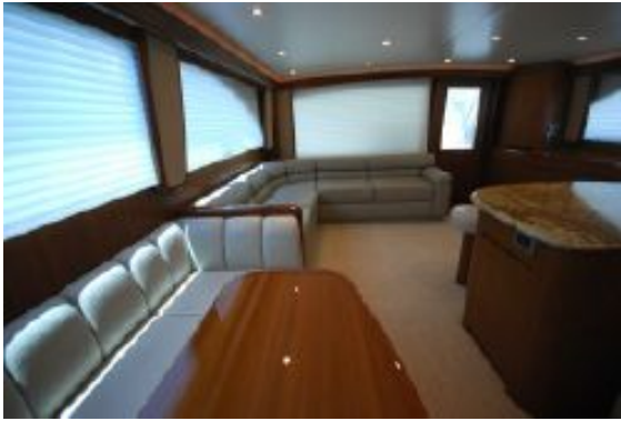
> Salon IV