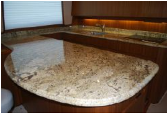
> Galley Granite