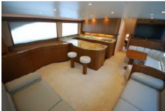
> Salon II