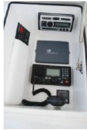
> Radio Box - Port