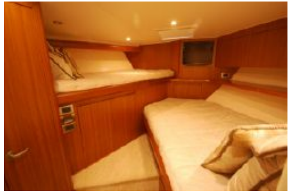
> VIP Forward