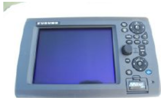
> Tower Navnet