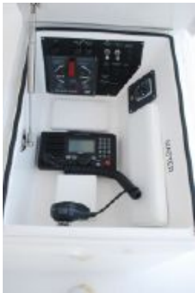
> Radio Box Stbd.