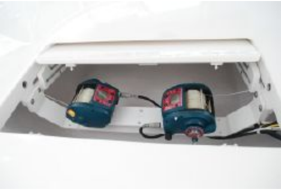
> Teaser Reels