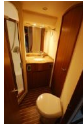
> Guest / Day Head