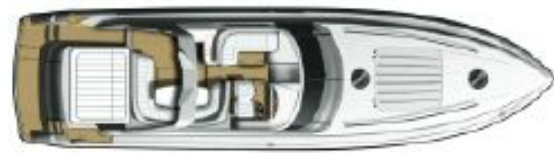
Main Deck Accommodation