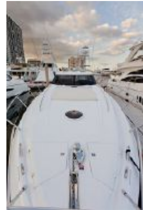
Bow looking aft